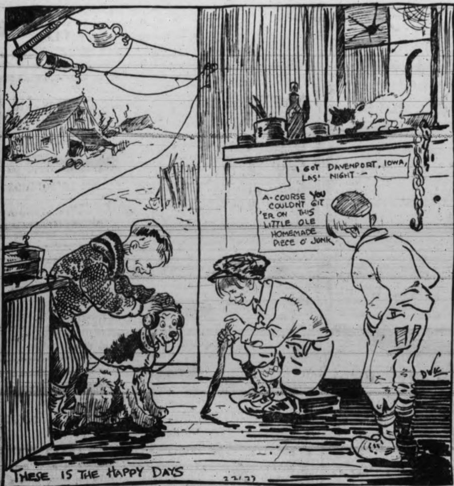
THESE IS THE HAPPY DAYS